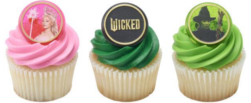
#62660 Wicked Assortment Cupcake Rings