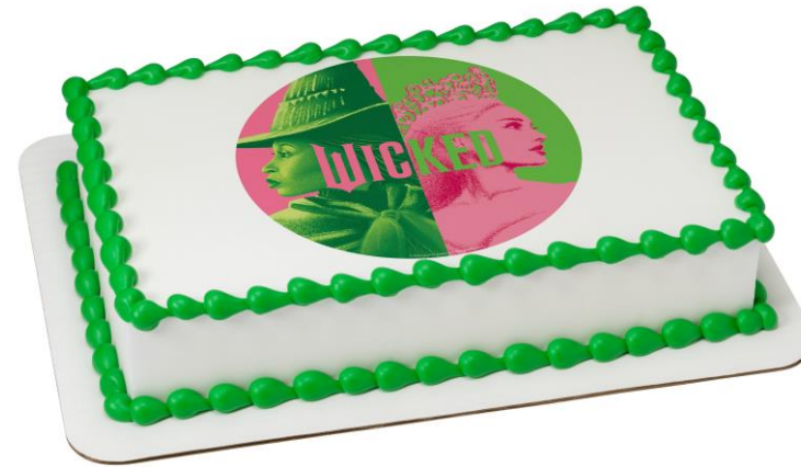
#62661 Wicked Glinda and Elphaba PhotoCake® Edible Image®