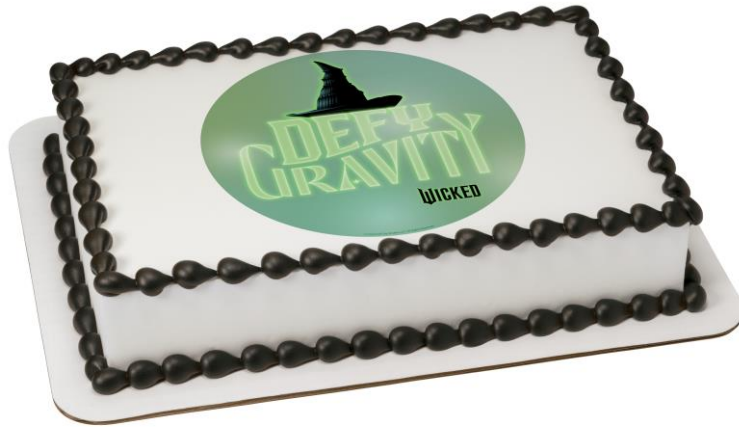
#62665 Wicked PhotoCake® Edible Image®

Images available on your connected PhotoCake Systems and on CelebrationIQ