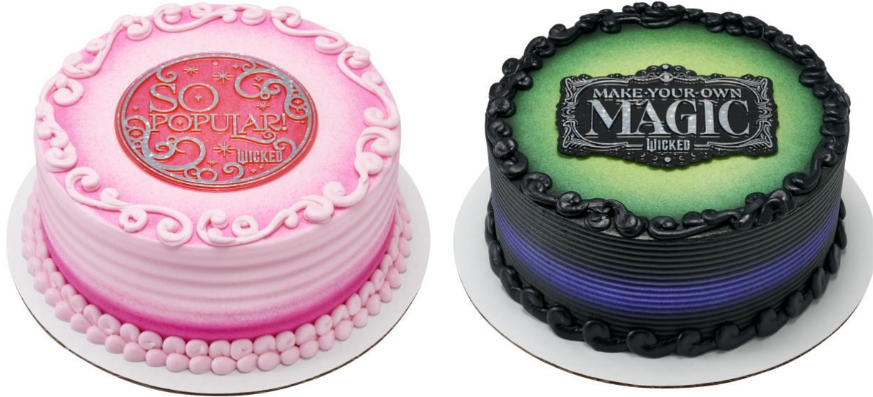
#62657 Wicked Assortment Layon