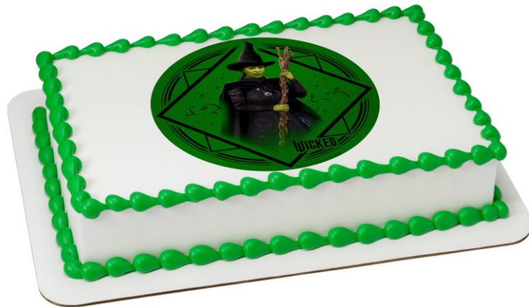
#62665 Wicked Elphaba PhotoCake® Edible Image®