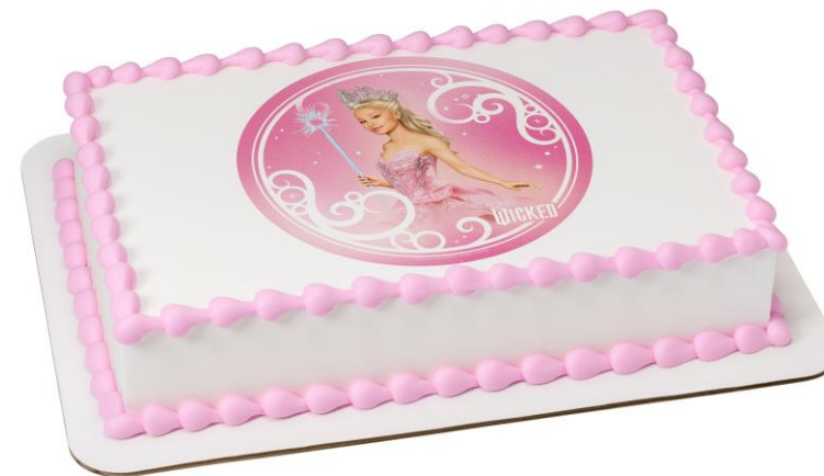
#62658 Wicked Glinda PhotoCake® Edible Image®