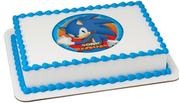
#58165 Sonic Boom™ Catch You Later PhotoCake® Edible Image®