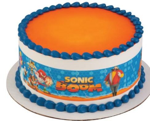
#58223 Sonic Boom™ Sonic Powered! PhotoCake® Edible Image® Strips