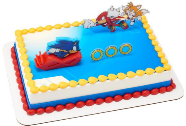
#29335 Sonic the Hedgehog™ PhotoCake® Edible Image® DecoSet® Background