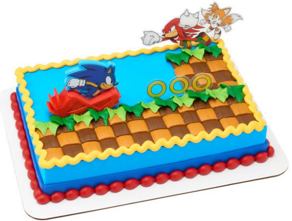
#29279 Sonic the Hedgehog™ DecoSet®