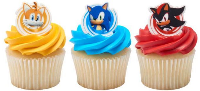
#29250 Sonic, Tails and Shadow Cupcake Rings