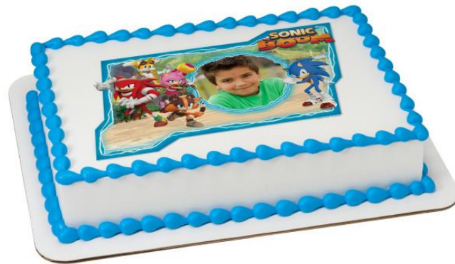
#58222 Sonic Boom™ Let's Do This PhotoCake® Edible Image® Frame