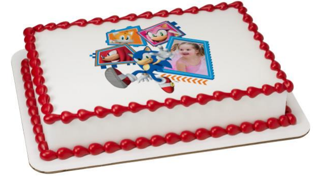
#29337 Sonic the Hedgehog™ and Friends PhotoCake® Edible Image® Frame