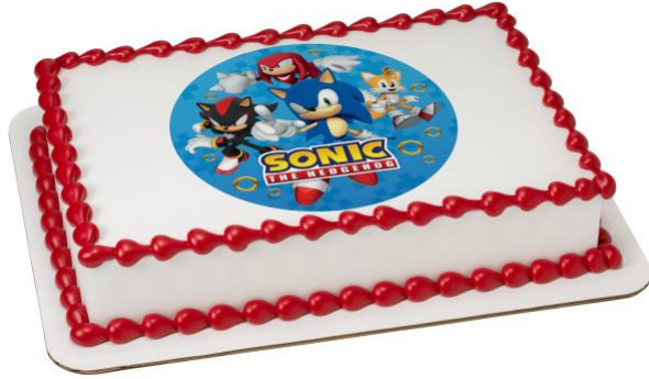
#29104 Sonic the Hedgehog™ Still Unstoppable PhotoCake® Edible Image®

Images available on your connected PhotoCake Systems and on CelebrationIQ