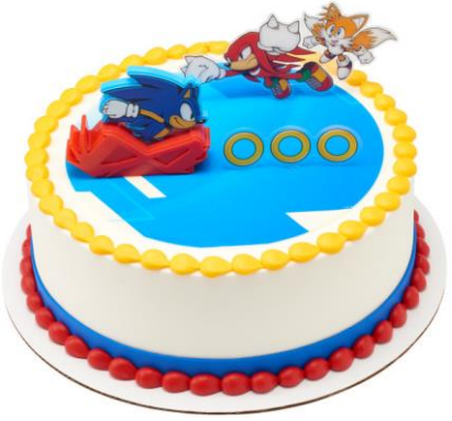
#29336 Sonic the Hedgehog™ PhotoCake® Edible Image® DecoSet® Background