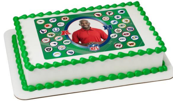
#28246 NFL Teams PhotoCake® Edible Image® Frame