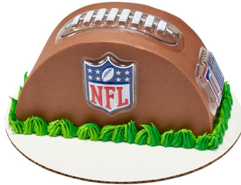
#23876 NFL Football Pop Tops®