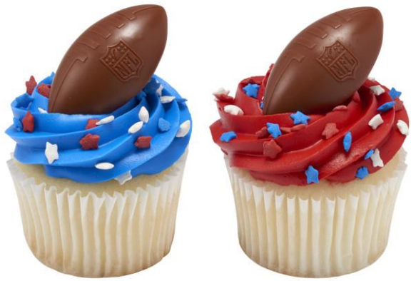
#15192 NFL Brown Football with Shield Cupcake Rings