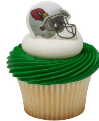
Every team Available NFL Team Helmet Cupcake Rings