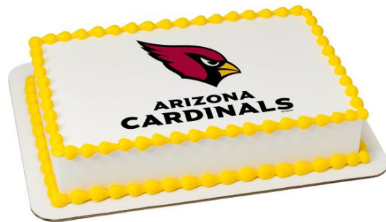
Every team Available NFL Team PhotoCake® Edible Image®