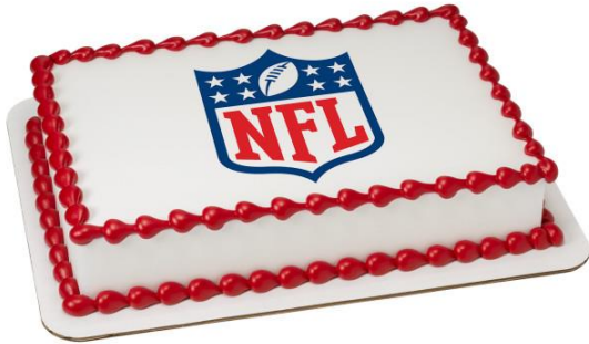
#4942 NFL Shield PhotoCake® Edible Image®

Images available on your connected PhotoCake Systems and on CelebrationIQ