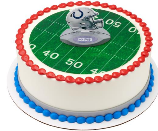
#29741 NFL Football & Tee PhotoCake® Edible Image® DecoSet® Background