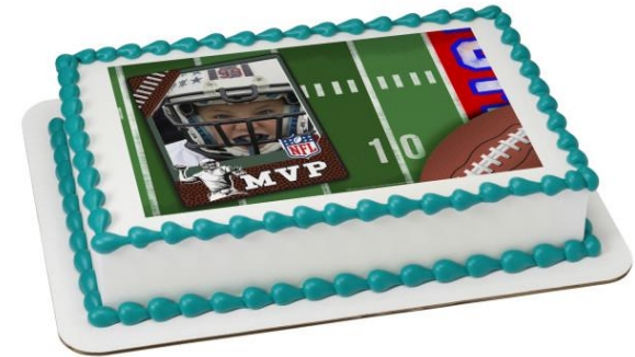
#29732 NFL MVP PhotoCake® Edible Image® Frame