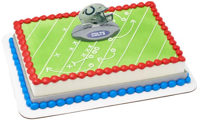
Every team Available NFL Football DecoSet® *Displayable Team Helmet