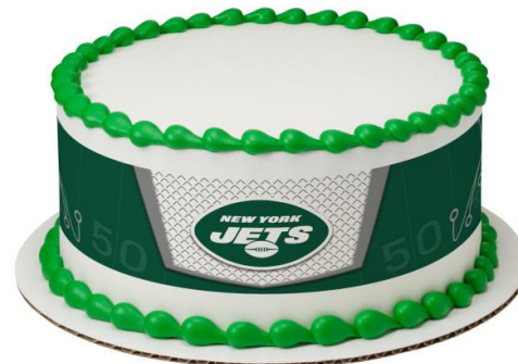
Every team Available NFL Team PhotoCake® Edible Image® Strips