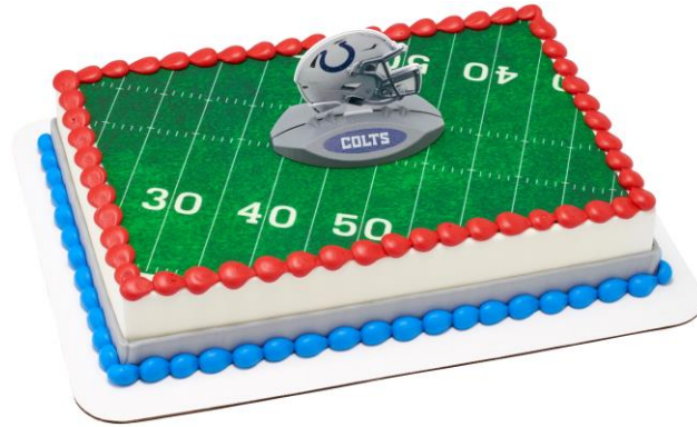
#29740 NFL Football & Tee PhotoCake® Edible Image® DecoSet® Background