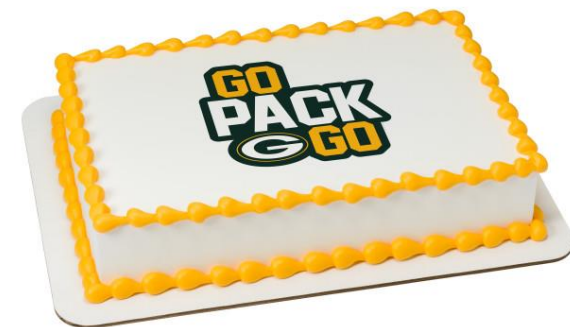
Select teams available Team Mantra PhotoCake® Edible Image®