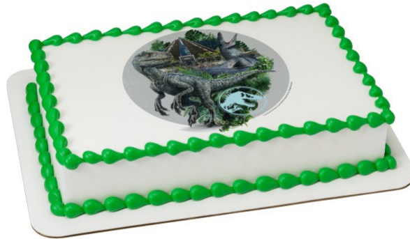
#27257 Jurassic World Raptor Paddock PhotoCake® Edible Image®