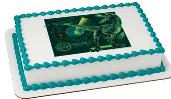
#22899 Jurassic World Fallen Kingdom Tracker PhotoCake® Edible Image®