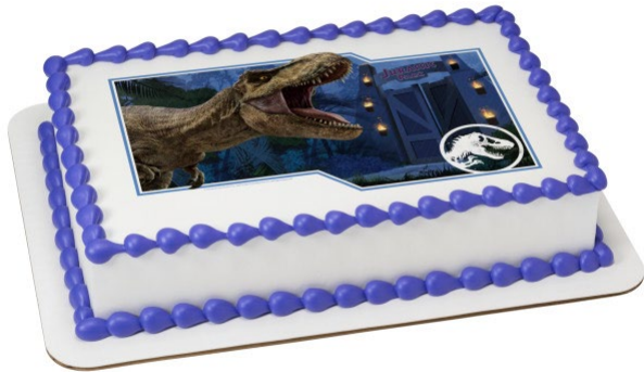
#27264 Jurassic World Danger PhotoCake® Edible Image®

Images available on your connected PhotoCake Systems and on CelebrationIQ