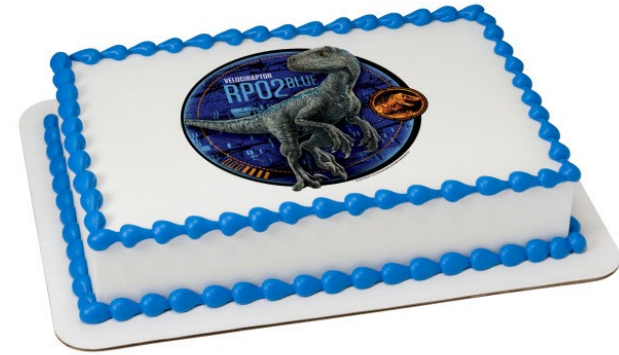
#44523 Jurassic World Fallen Kingdom Blue PhotoCake® Edible Image®