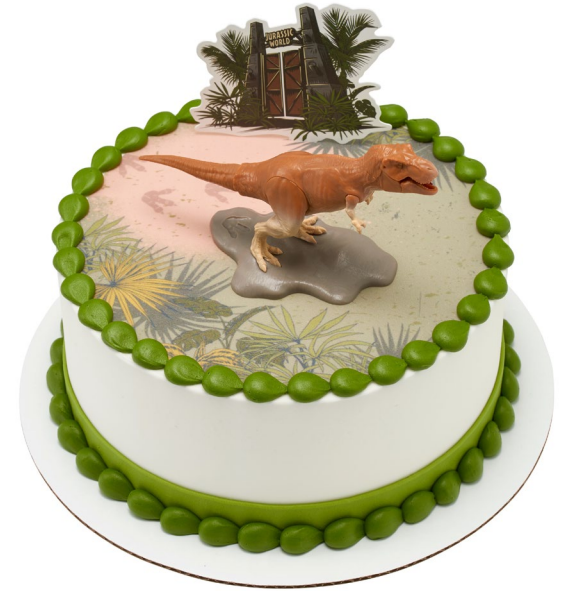
#62721 Jurassic World Rule the Earth PhotoCake® Edible Image® DecoSet® Background