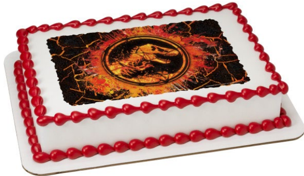
#22897 Jurassic World Fallen Kingdom Molten PhotoCake® Edible Image®