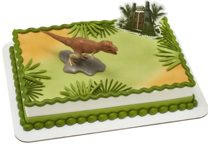
#62720 Jurassic World Rule the Earth DecoSet®