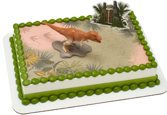
#62697 Jurassic World Rule the Earth PhotoCake® Edible Image® DecoSet® Background