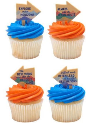
#29326 Adventure Awaits DecoPics®