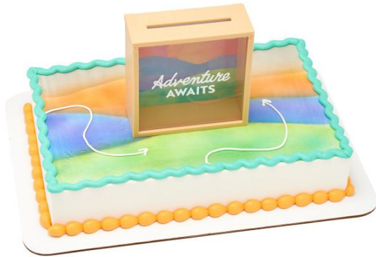
#29268 Adventure Awaits DecoSet®