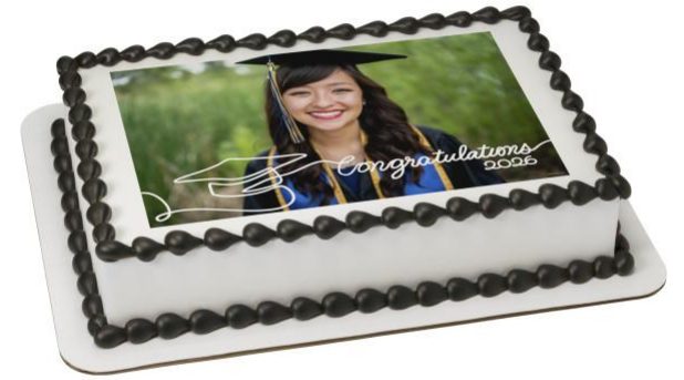
#663181 2026 Congratulations PhotoCake® Edible Image® Frame