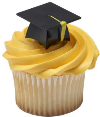
#47087 3D Hat DecoPics®