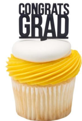
#27060 Congrats Grad DecoPics®