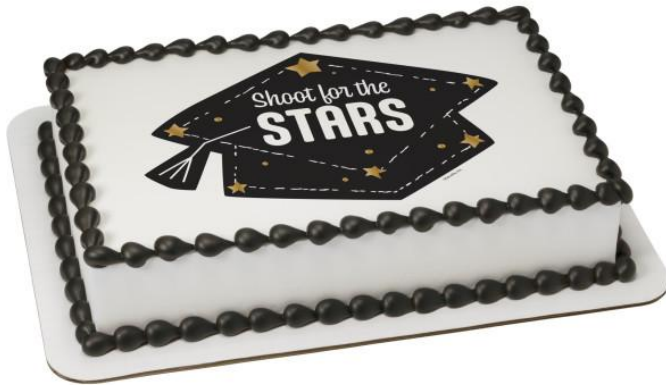
#29267 Shoot for the Stars PhotoCake® Edible Image®