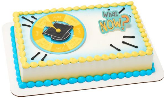
#28545 What Now? Grad Spinner DecoSet®