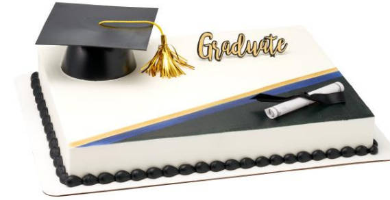
#21764 Mega Hat Graduate DecoSet®