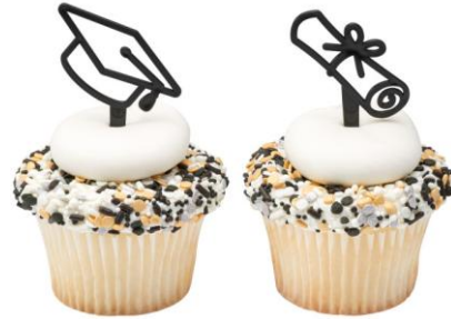
#25337 Graduation Icons DecoPics®