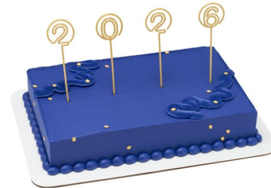
#63110 2026 Cake Kit