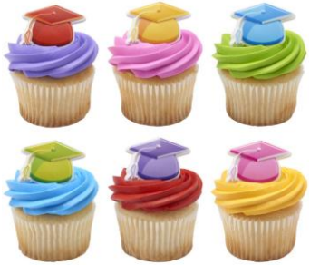
#28591 Bright Grad Hats Cupcake Rings