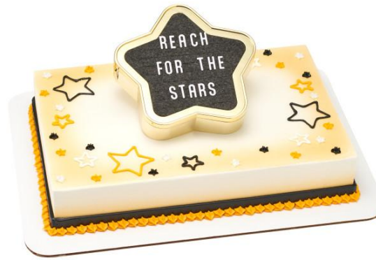
#29272 Star Grad Letter Board DecoSet®