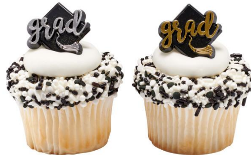
#22403 Grad Foil Cupcake Rings