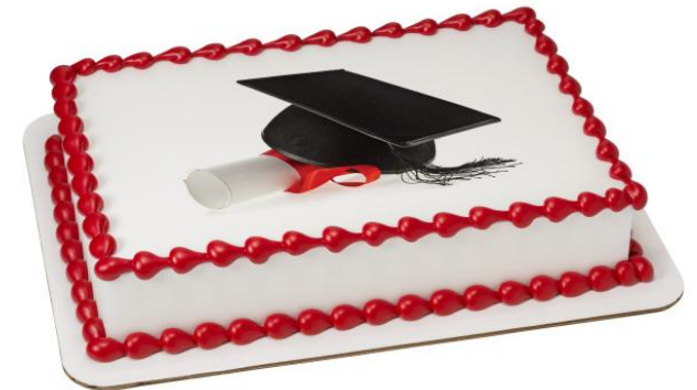
#25457 Graduation Hat PhotoCake® Edible Image®