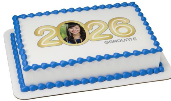
#63180 Gold 2026 Graduate PhotoCake® Edible Image® Frame