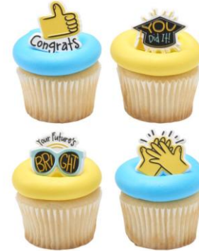
#28547 Bright Future Rings