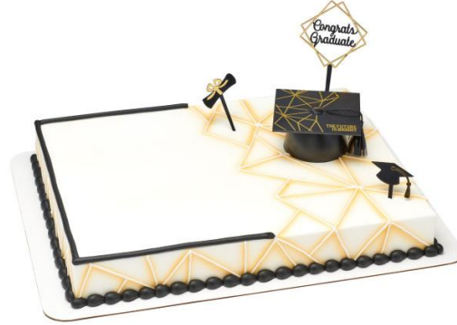
#25407 The Future is Bright DecoSet®