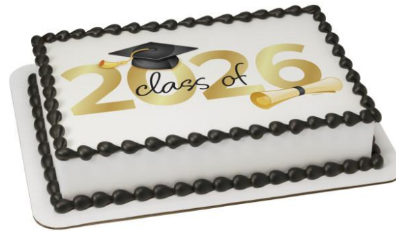
#48600 Traditional Grad 2026 PhotoCake® Edible Image®