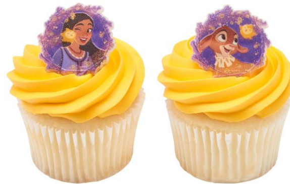
#29249 Disney's Wish Better Together Cupcake Rings