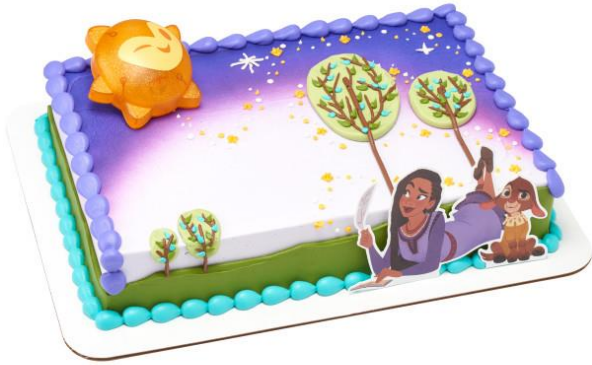
#29251 Disney's Wish Shining Star DecoSet®