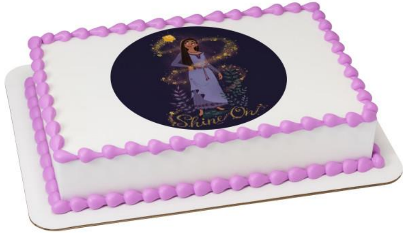
#29081 Disney's Wish Shine On PhotoCake® Edible Image®

Images available on your connected PhotoCake Systems and on CelebrationIQ