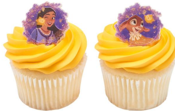
#29249 Disney's Wish Better Together Cupcake Rings