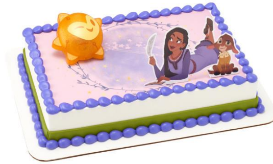
#47742 Disney's Wish Shining Star PhotoCake® Edible Image® DecoSet® Background