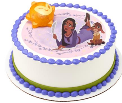
#47743 Disney's Wish Shining Star PhotoCake® Edible Image® DecoSet® Background