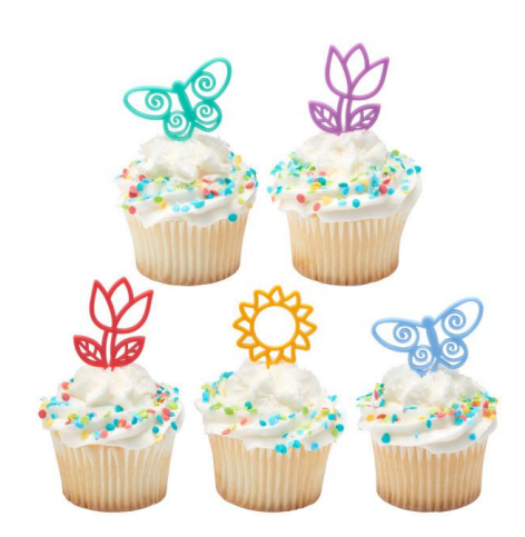
#25338 Springtime Assortment DecoPics®