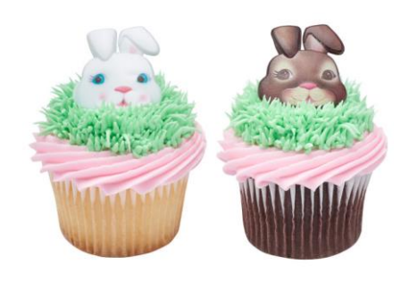
#25443 Cute Bunny Faces Cupcake Rings