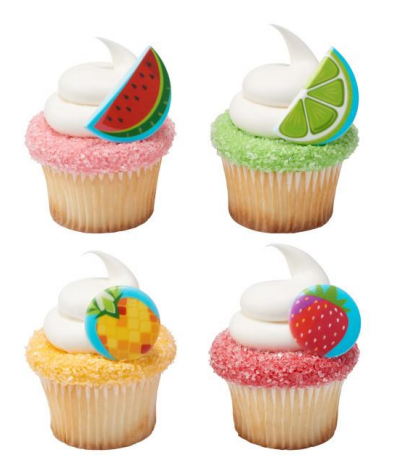
#25601 Fruit Assortment Cupcake Rings