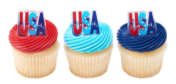
#25493 USA Cupcake Rings