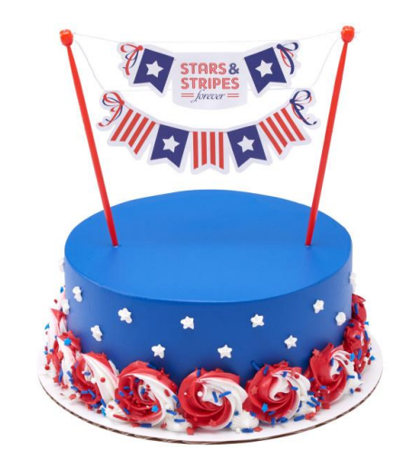
#27925 Stars and Stripes Forever Banner Layon