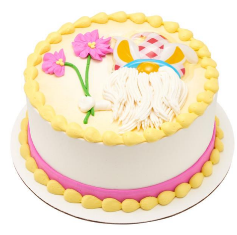
#28461 Easter Gnome Pop Tops®