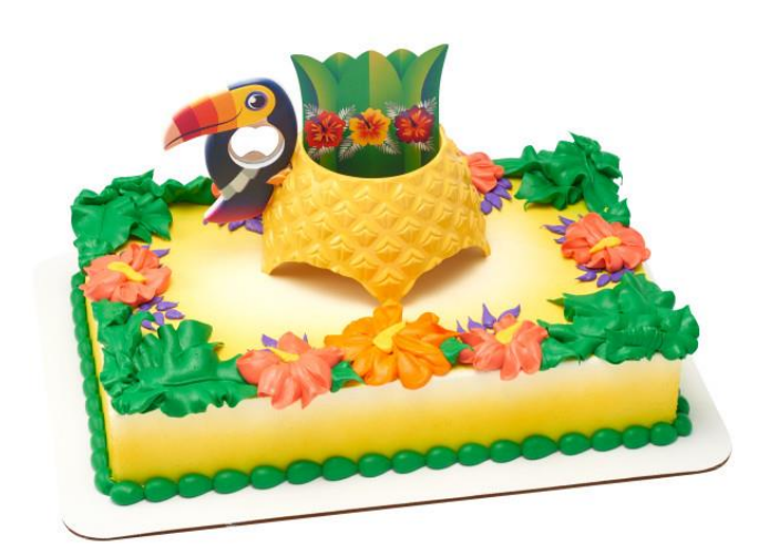
#29277 Tropical Vibes DecoSet®