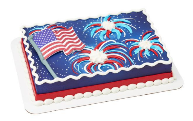
#38869 USA Flag Layon