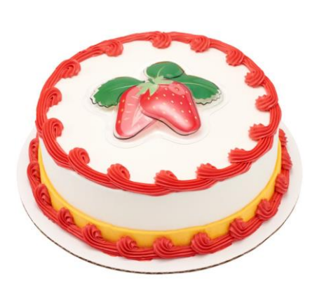
#28514 Strawberry Pop Tops®