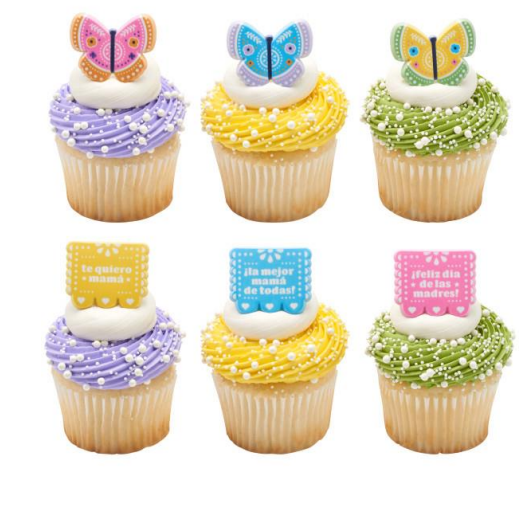
#28460 :a Mejor Mama de Todas! Cupcake Rings