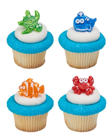
#38622 Beach Cuties Cupcake Rings