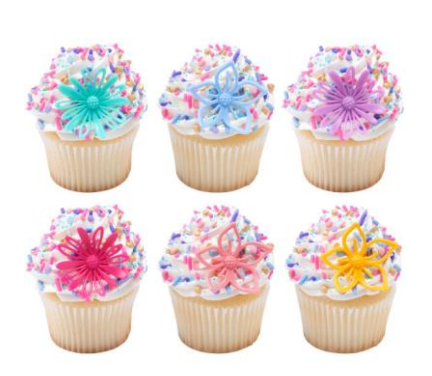
#25474 Flowers Assortment Cupcake Rings