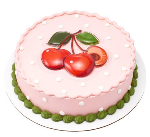
#28794 Cherry Pop Tops®