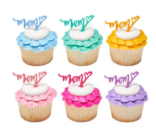
#25440 Mom DecoPics®