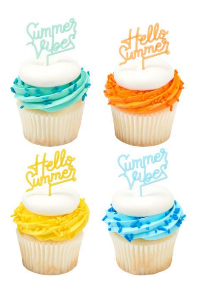
#27171 Summer Sayings DecoPics®