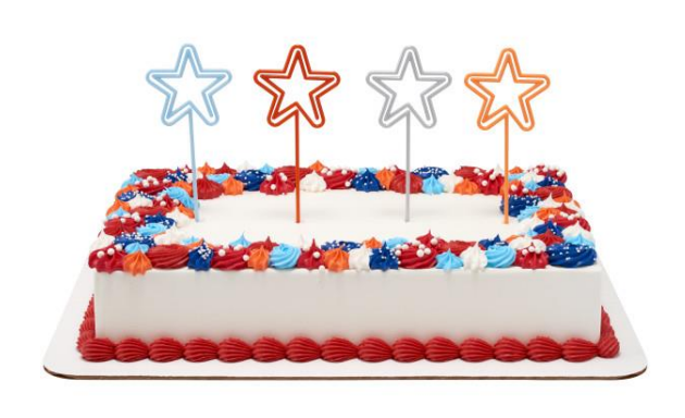
#28790 Star Skewer