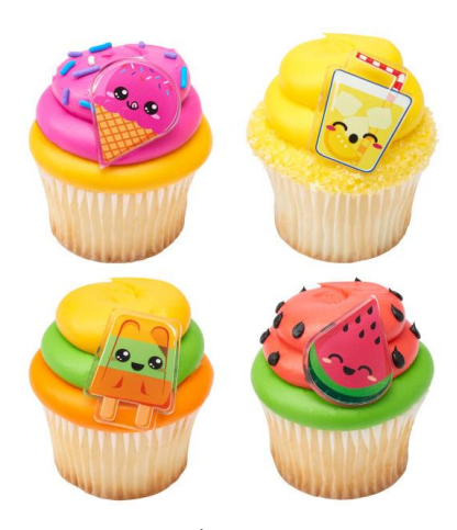
#25505 Cool Summer Treats Cupcake Rings