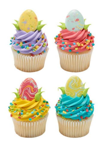
#21692 Painted Eggs Cupcake Rings