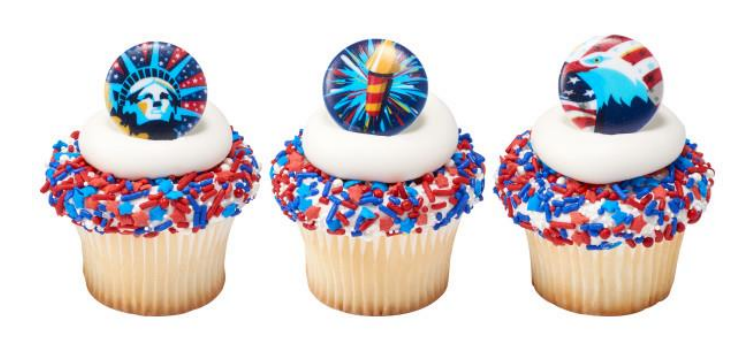
#25614 Celebrate Liberty Cupcake Rings