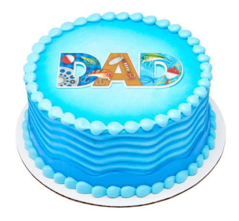
#27146 Hobby Dad Layon