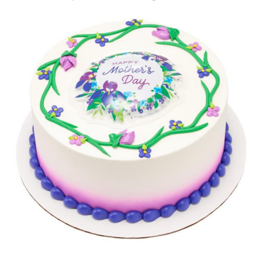
#28479 Mother's Day Blooms Pop Tops®