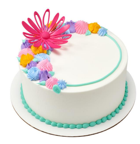
#25470 Blossoming Flowers Layon