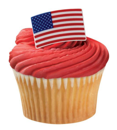
#37916 American Flag Cupcake Rings