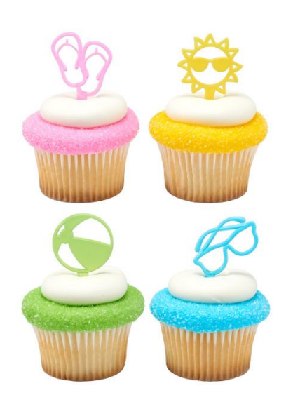
#23750 Summer Fun DecoPics®