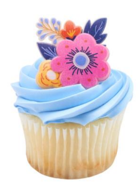
#27021 Spring Floral Cupcake Rings