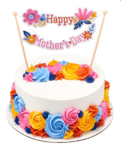
#26873 Happy Mother's Day Banner Layon