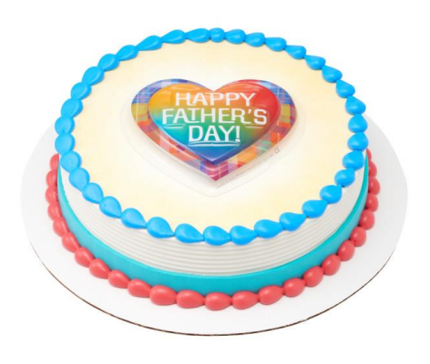
#28786 Father's Day Plaid Pop Tops®