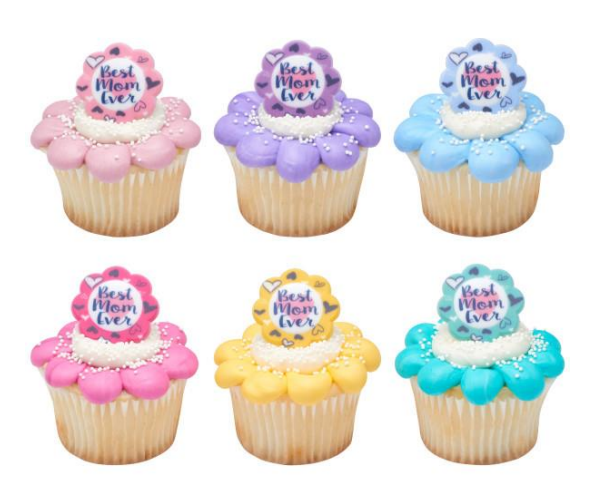
#25465 Best Mom Ever Cupcake Rings