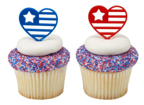
#27176 USA Love DecoPics®