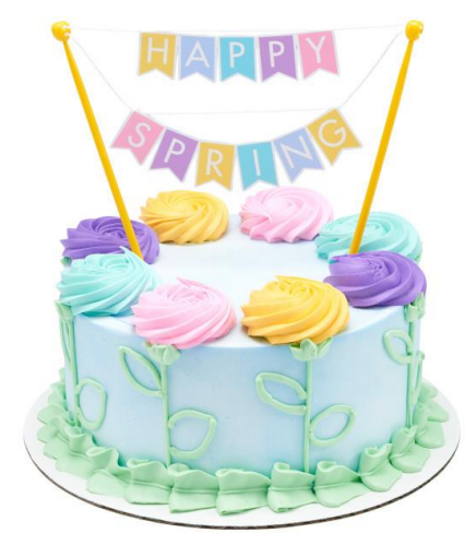
#27022 Happy Spring Banner Layon