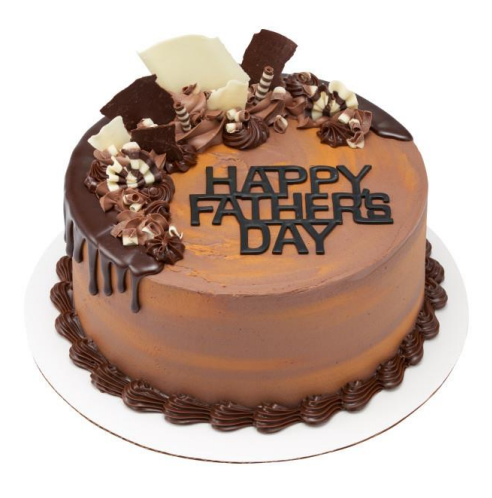
#28782 Happy Father's Day Layon