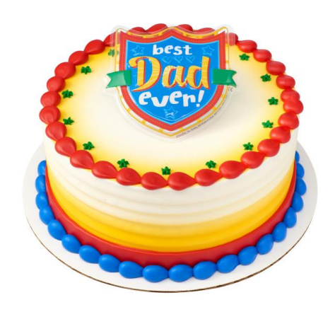
#25503 Father's Day Hero Assortment Pop Tops®