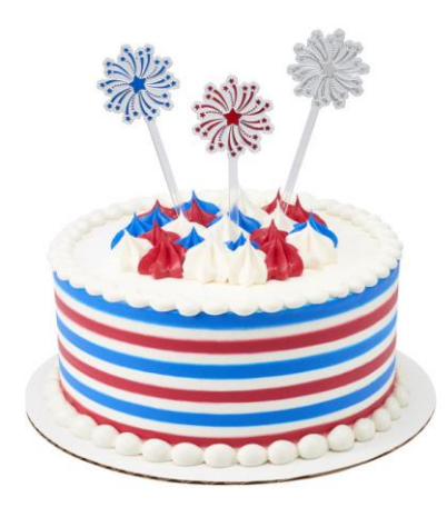
#27177 Fireworks Skewer