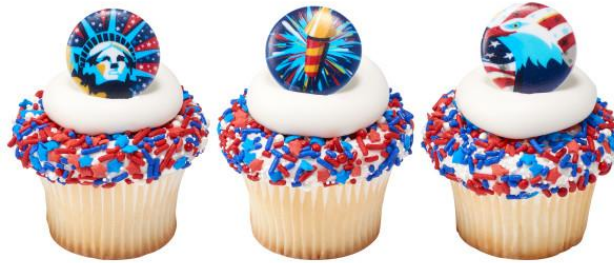
#25614 Celebrate Liberty Cupcake Rings