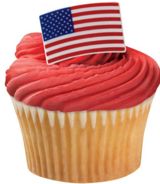
#37916 American Flag Cupcake Rings