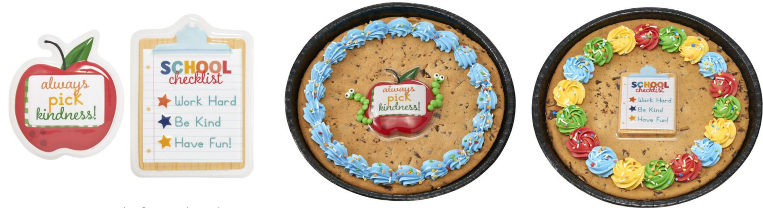
#29298 Ready for School Pop Tops®