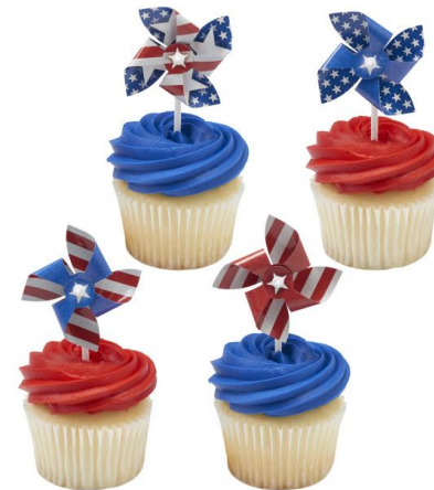
#48616 Red, White and Blue Pinwheels DecoPics®