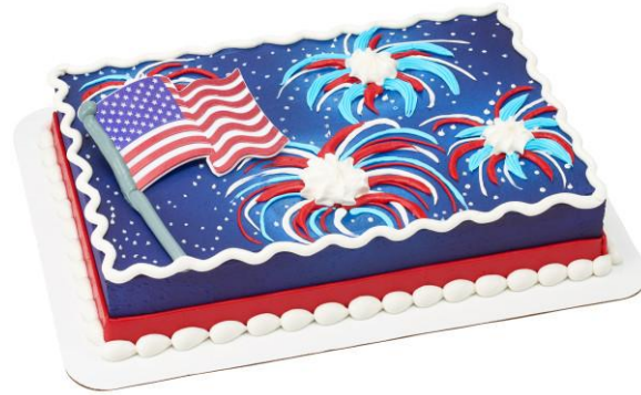
#38869 USA Flag Layon