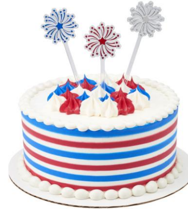
#27177 Fireworks Skewer