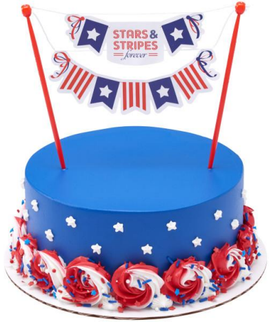
#27925 Stars and Stripes Forever Banner Layon