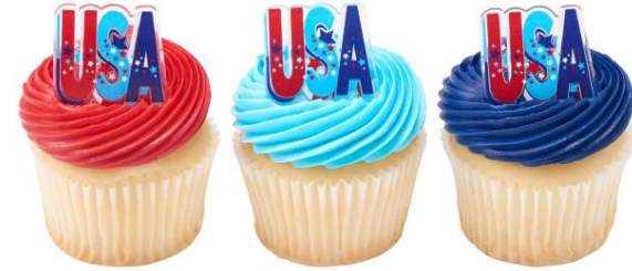
#25493 USA Cupcake Rings