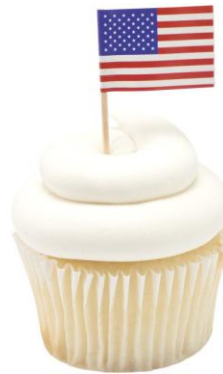
#29276 American Flag DecoPics®