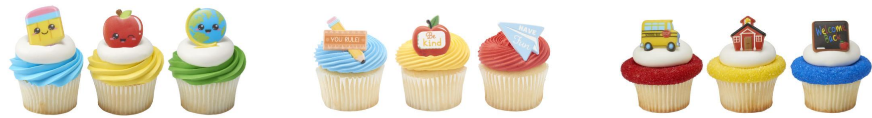
#27169 Kawaii Back to School Cupcake Rings