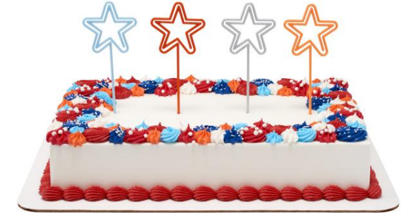
#28790 Star Skewer