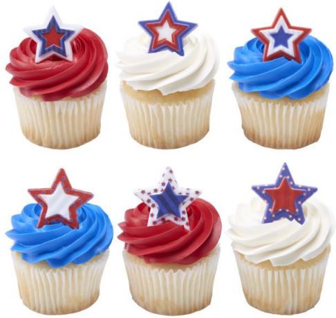
#38054 Printed Star Assortment Cupcake Rings