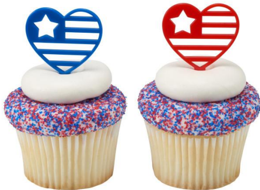
#27176 USA Love DecoPics®