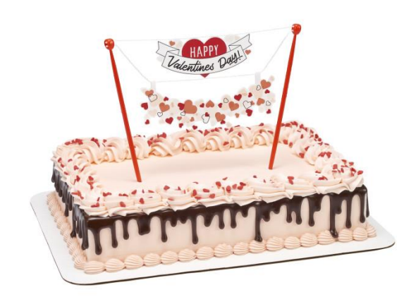
#27084 Happy Valentine's Day Banner Layon