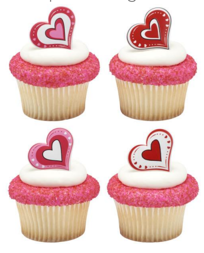
#23262 Love is in the Air Cupcake Rings