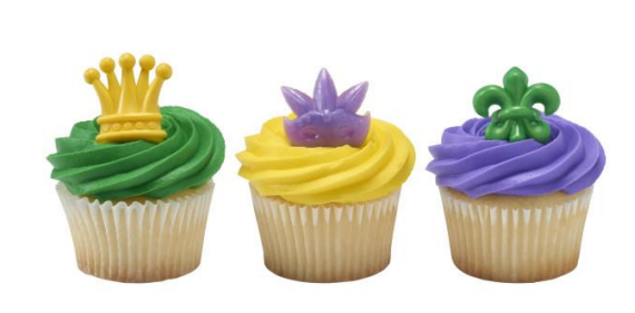
#29976 Life of the Mardi Cupcake Rings