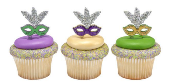
#24737 Mardi Gras Glitter Mask DecoPics®