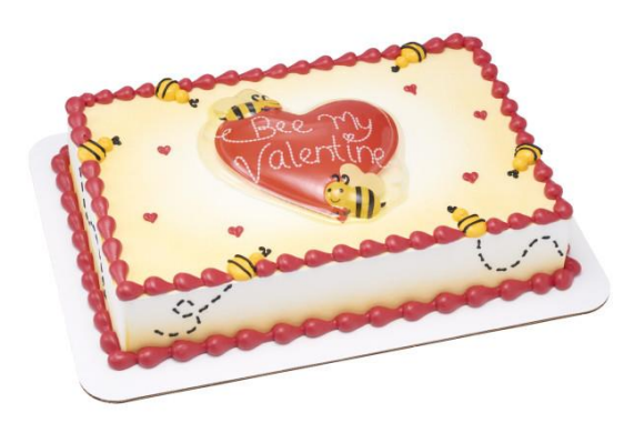
#47437 Bee My Valentine Pop Tops®