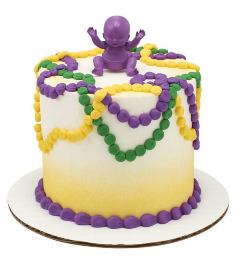
#29117 Kings Cake Baby Assortment Layon