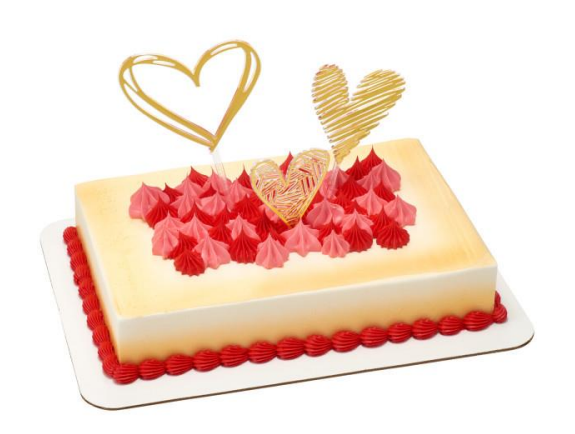
#26521 Gold Hearts Cake Kit