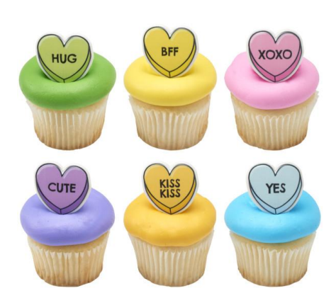
#28343 Candy Hearts Cupcake Rings