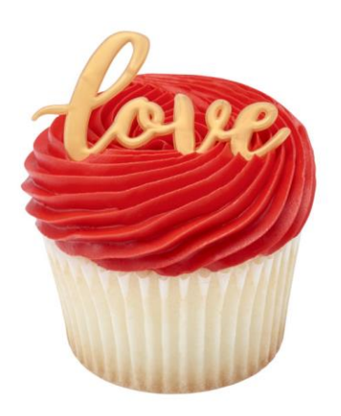
#26384 Gold Love Cupcake Layon