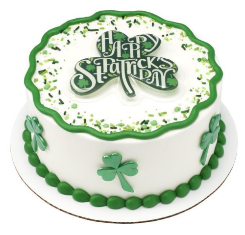
#24565 3 Leaf Clover Pop Tops®