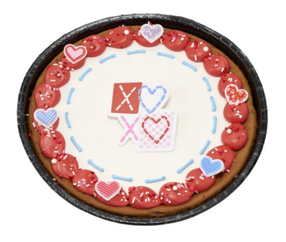
#28337 Cross My Heart XOXO Layon