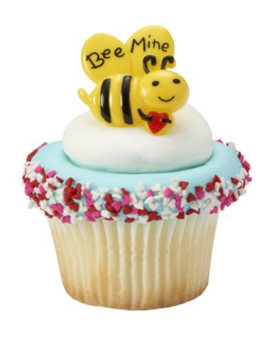
#41748 Bee Mine Cupcake Rings