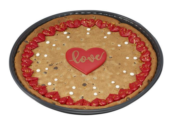
#23264 Love Layon