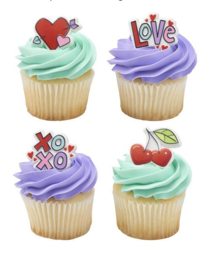
#28344 Rainbow Love Cupcake Rings