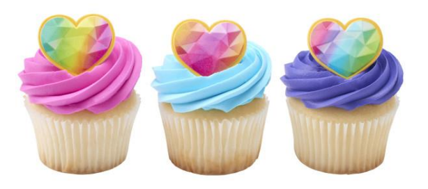
#27629 Rainbow Prism Heart Cupcake Rings