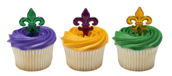
#38854 Fleru De Lis Translucent DecoPics®