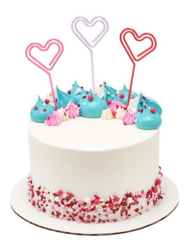
#28349 Hearts Skewer