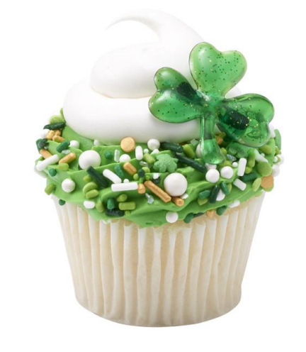
#41580 Shamrock Puffy Glitter Cupcake Rings