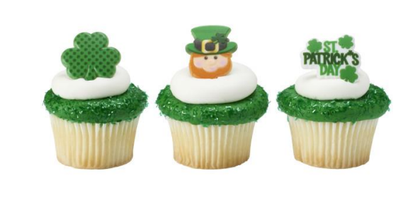
#21873 St. Patrick's Day Icons Cupcake Rings