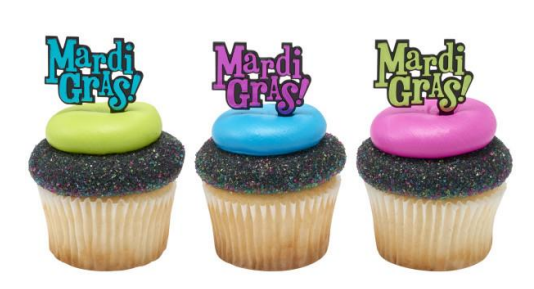
#16259 Mardi Gras Foil DecoPics®