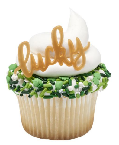
#26340 Gold Lucky Cupcake Layon