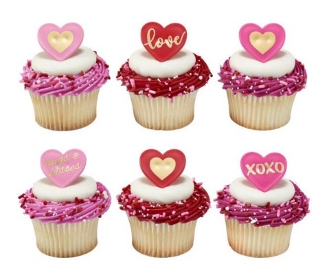
#23278 Love Heart Cupcake Rings