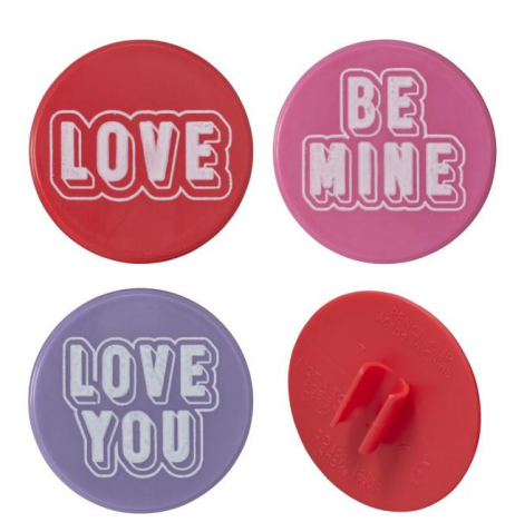
#29040 Valentine Pencil Clip Cupcake Layon