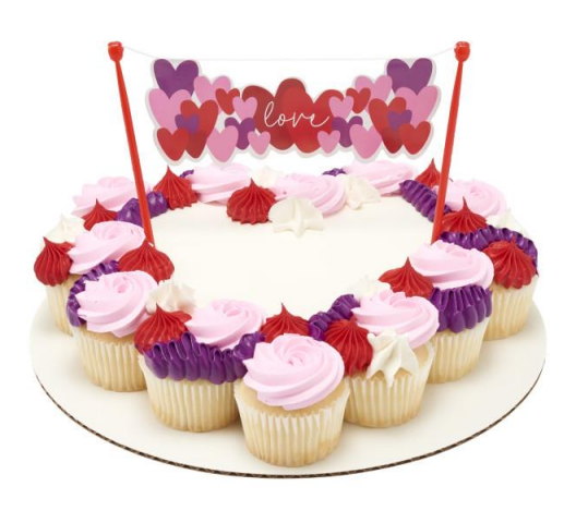
#29112 Love and Hearts Banner Layon