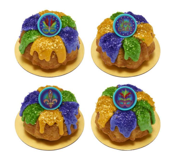
#224739 Mardi Gras Celebration Cupcake Rings