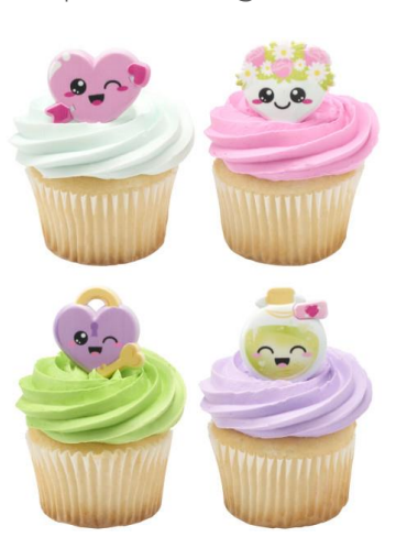
#28345 Valentine Cuties Cupcake Rings