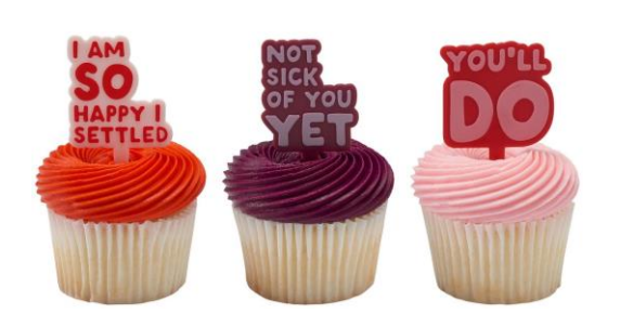
#29794 Not Sick of You Yet DecoPics®