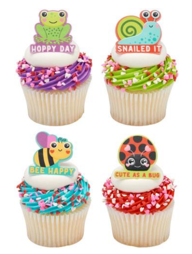
#29788 Critter Cuties Cupcake Rings