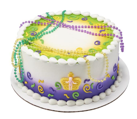
#41269 Mardi Gras Baby Crown Necklace Set Layon (Necklace with Crown Charm) #41297 Mardi Gras Bead Necklace (Just the necklace)