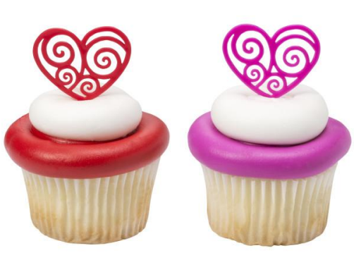
#6282 Scroll Heart DecoPics®