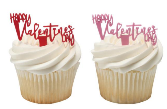
#26477 Happy Valentine's Day Script DecoPics®