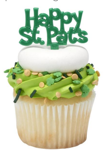
#38837 Happy St. Pat's DecoPics®