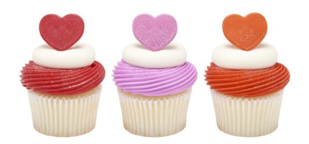
#29881 Shimmer Hearts Cupcake Rings