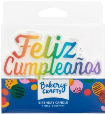
#28757 Feliz Cumpleaños Bright Shaped Candles