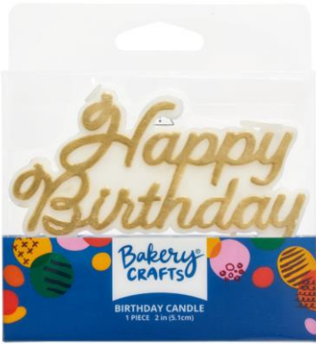
#28756 Happy Birthday Gold Shaped Candles