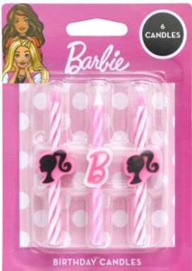
COMING in March #47797 Barbie™ Icon Character Candles