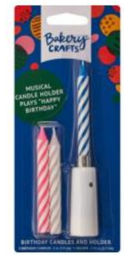
Musical Happy Birthday Candles Item #8770 (12/pkg)