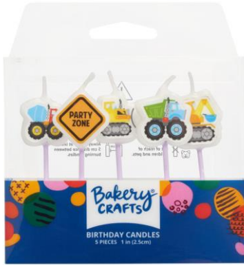
#28754 Construction Shaped Candles