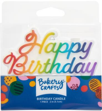
#28755 Happy Birthday Bright Shaped Candles