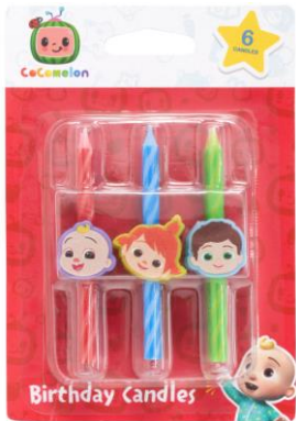
#28759 CoComelon™ Icon Character Candles