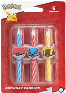
#28760 Pokémon Poké Balls Icon Character Candles