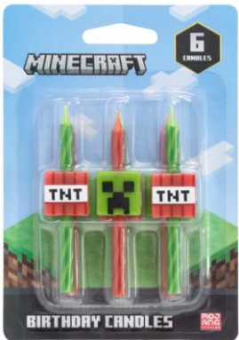
#28758 MINECRAFT Icon Character Candles